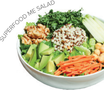
SUPERFOOD ME SALAD