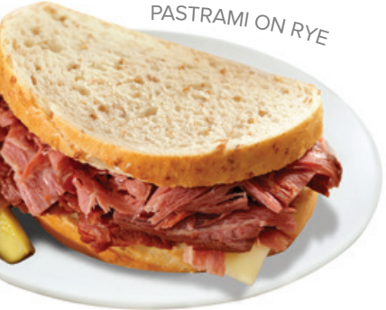
PASTRAMI ON RYE