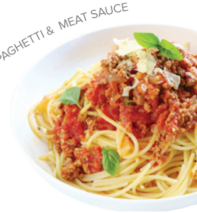
SPAGHETTI & MEAT SAUCE