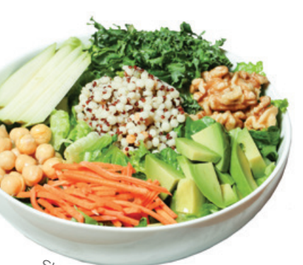
SUPERFOOD ME SALAD